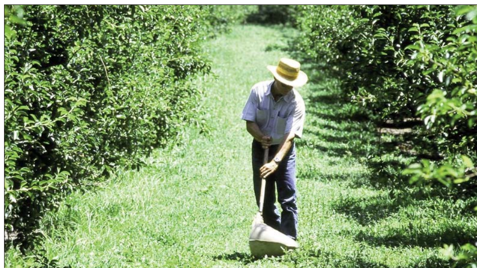
Scouting for pests and beneficials in a biointensive IPM orchard system

In the mid-1980s the seed and pesticide industries took advantage of the emerging tools of molecular biology to create transgenic plants expressing genes capable of the systemic production in plant cells of Bacillus